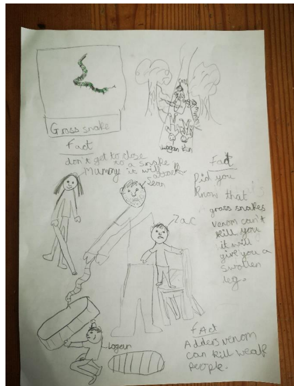
Logan shared how he saved a grass snake